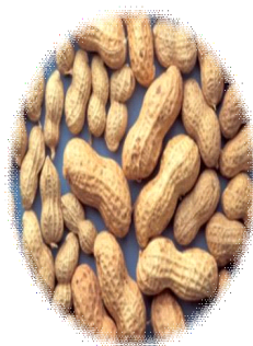
Handling, Shelling, Processing